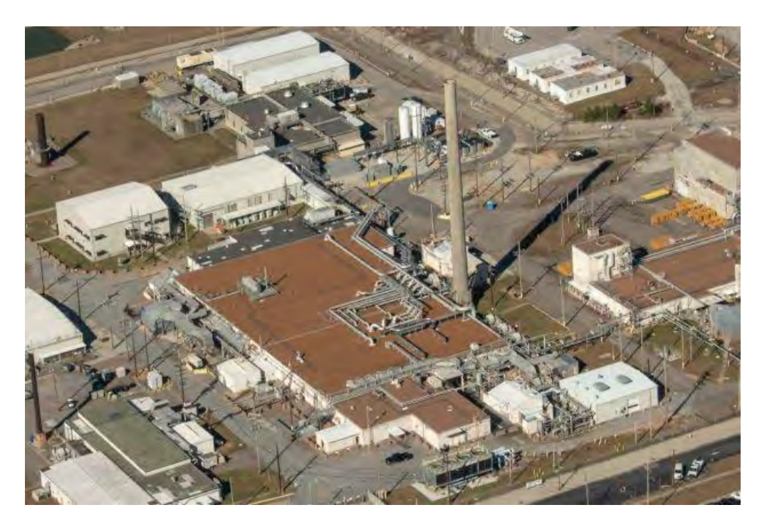
Figure 1. Aerial View of 296-H Stack, next to Building 234-H, at SRTE

DSA. NNSA approved the combined Tritium Facilities DSA in December 2019 but has not yet implemented it. NNSA plans to partially implement this DSA by the end of calendar year 2023.